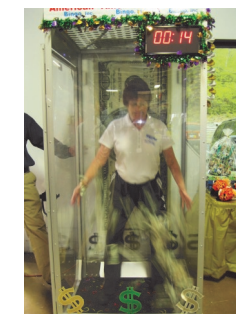
Rent our Cash Cage for your next event!

In addition to great deals, lessons and food, attendees had the opportunity to win time in our cash cage. Players had the chance to win money, prizes, or double valued buying credit. Grand prize raffles were drawn daily.